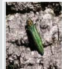
Emerald Ash Borer - click image for info

~ Cottage Dreams announces the " Casino Royale Gala ," an evening of gambling, dancing, cocktails and shopping, on Saturday, February 25, 2012. Get tickets online! Get details..